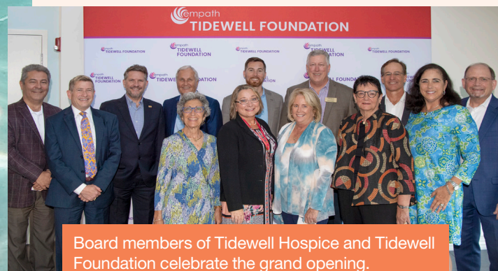
Board members of Tidewell Hospice and Tidewell Foundation celebrate the grand opening.