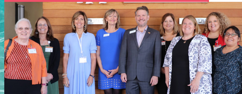
We salute the dedicated Tidewell/Empath North Region's Volunteer Coordinators!