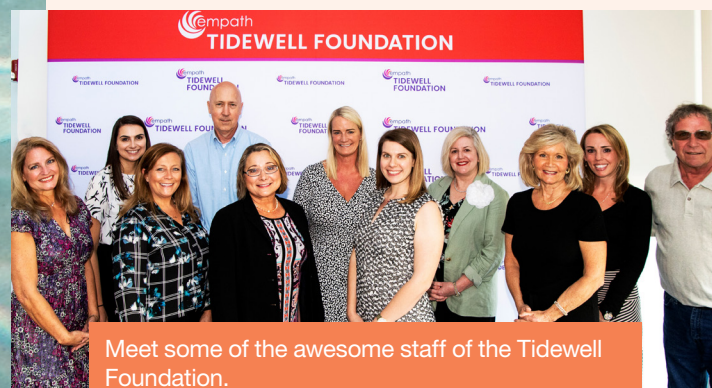
Meet some of the awesome staff of the Tidewell Foundation.